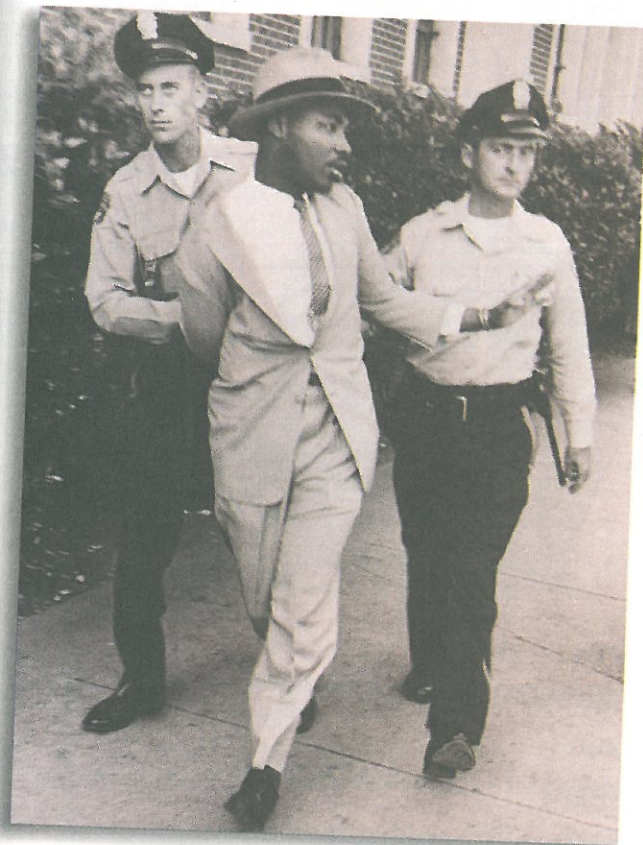
Martin Luther King, Jr., is shown here during one of his first nonviolent confrontations with police.

Something else happened in Montgomery after Rosa was arrested. The African Americans there decided to stop riding the buses. They carpooled. They hitchhiked. They took cabs. And, they walked. But, they stayed off the buses. They decided to stay off the buses until the bus companies changed the rules.