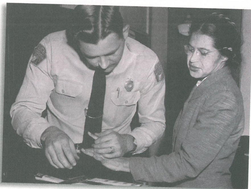
Rosa Parks is fingerprinted after her arrest in Montgomery, Alabama, on December 1, 1955.

Why did Martin Luther King, Jr., decide to be nonviolent in his protests? He said we will wear down the people who hate us by showing our strength. This show of strength will cause them to give us our rightful freedom and earn their respect at the same time.