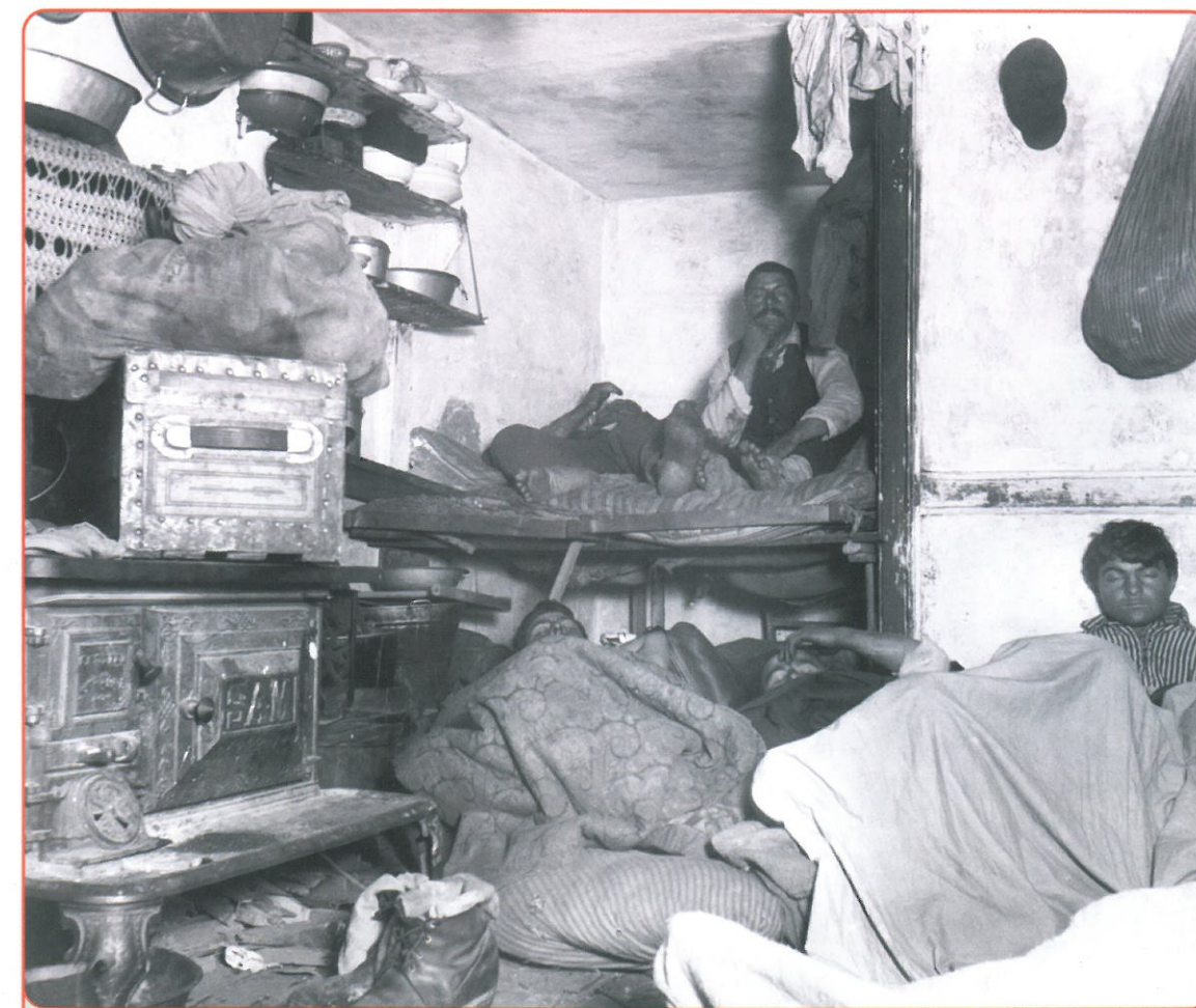
Overcrowded housing in New York

Some Americans worried about the overcrowding. They thought that work would become hard to find. They worried that the Irish would take their jobs. As a result, many people decided not to hire Irish immigrants. It took a long time for the Irish to be accepted in their new country.