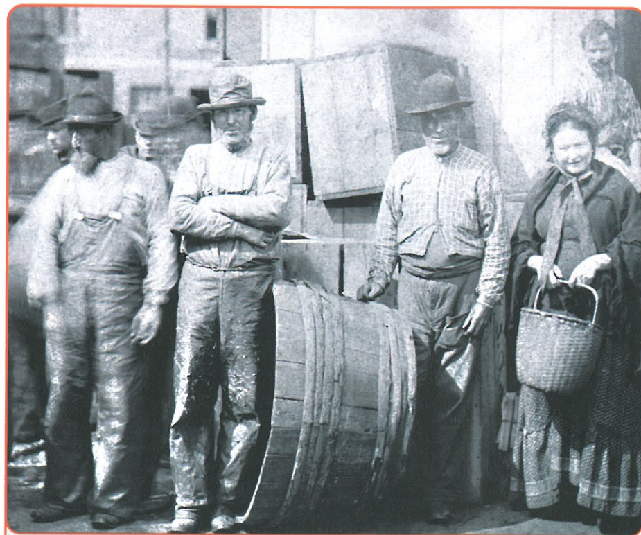
Irish clam diggers on a wharf in Boston, 1882

One way the Irish helped American society was through hard work. In the early days, they took all kinds of hard jobs. The Irish dug canals. They built roads and railroads. They worked in factories, mills, and coal mines. These jobs helped America grow.