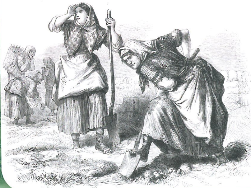
Irish potato farmers

Ireland is part of a group of islands called the British Isles. In the 1800s, Ireland was ruled by Britain. Most Irish people were farmers. But they did not own the land. The Irish farmers grew the food they needed.