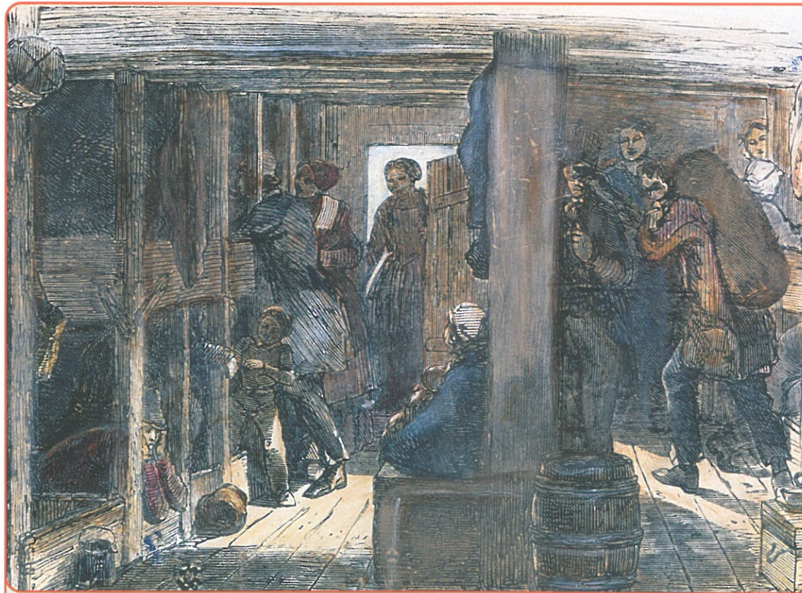
Irish people on a ship bound for North America

Many ships carrying immigrants sailed from Ireland to Canada. It was a journey of 3,000 miles (4,828 kilometers). It took 40 to 70 days.