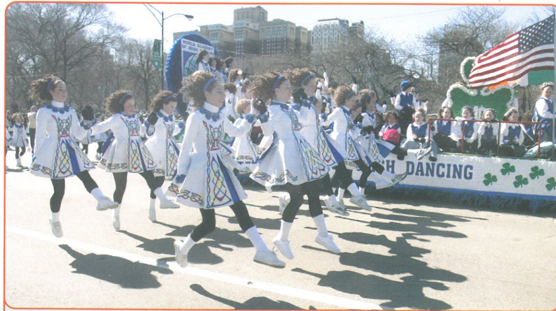
Irish dancers in a St. Patrick's Day parade in Chicago

Irish Americans have done well in politics, sports, business, and many other fields. Georgia O'Keeffe was an artist in the early 1900s. She was born into an Irish American family in Wisconsin. Some Irish Americans have even become president. John F. Kennedy was the great-grandson of Irish immigrants. Over 30 million Americans today claim descent from Irish immigrants.