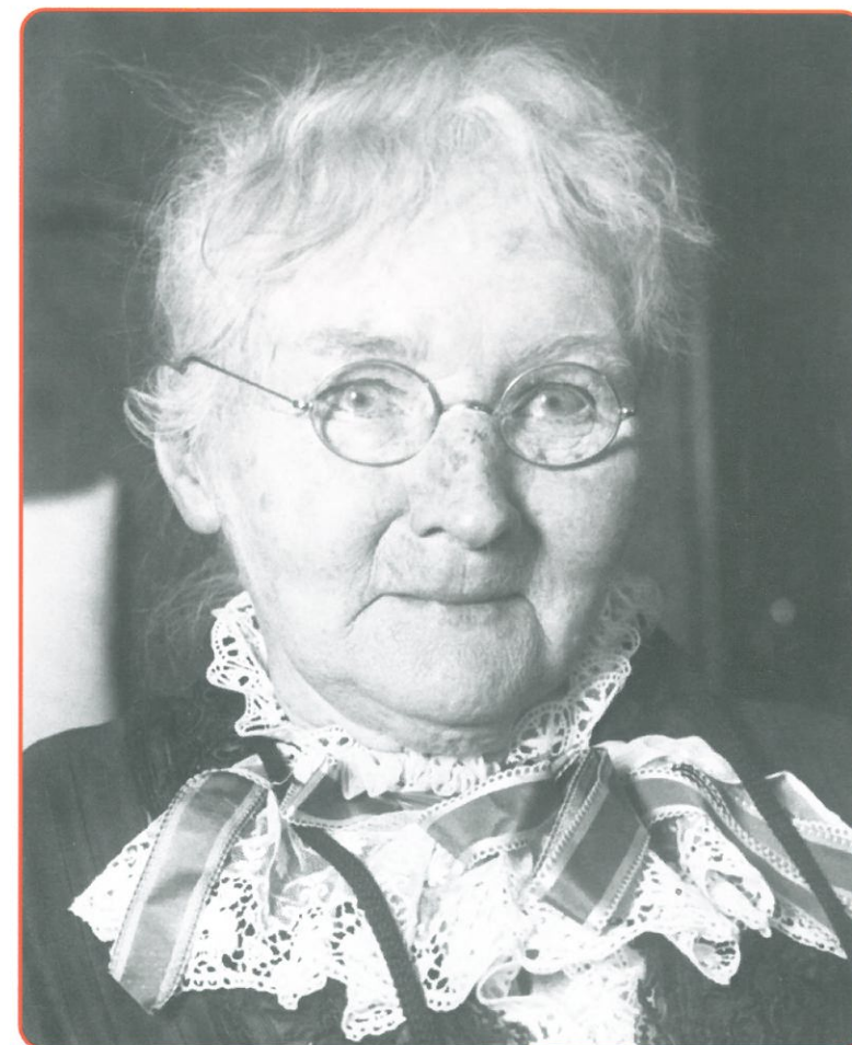
Mary Harris, known as "Mother Jones," was an Irish immigrant. She fought for the rights of working-class Americans.

Over time, the number of Irish Americans grew. They were able to vote Irish people into local governments . The Irish who worked for local governments helped other Irish get good jobs. Many Irish got jobs as police officers and firefighters.