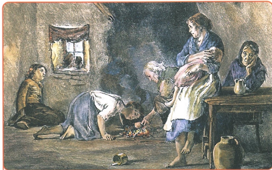
A struggling family in Ireland during the famine

The Irish farmers grew mainly wheat, barley, and potatoes. The land owners sold the wheat and barley to other countries. Potatoes were the main food for the Irish.