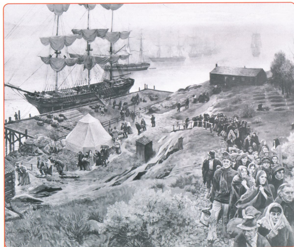
Irish immigrants arriving in Canada

Many Irish people first went to Canadian cities. There, they crowded into cheap boarding houses. Sometimes up to ten people lived in one room. People who had nowhere to go lived on the streets. Many people still suffered from diseases.